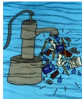
illustrating how clean water results in far more than better health.

West Side's Mission Council has budgeted $12,500 in 2011 toward a water well. We are asking you to join us in raising an additional $12,500 between Apr. 3-May 22 for the Mali Water Drive. Bright-colored envelopes are in the pews.